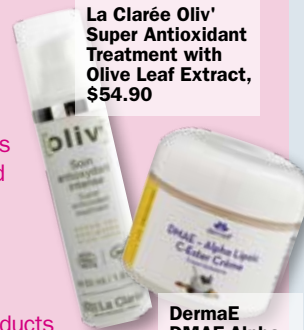
La Clarée Oliv' Super Antioxidant Treatment with Olive Leaf Extract, $54.90

When to use it: Can be found in a range of skincare products so use as appropriate.