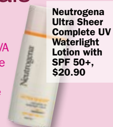
Neutrogena Ultra Sheer Complete UV Waterlight Lotion with SPF 50+, $20.90

When to use it: Any time you plan to be outdoors. In terms of application, use sunscreen after your moisturiser but before foundation.