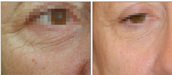
Before and after 3 sessions.