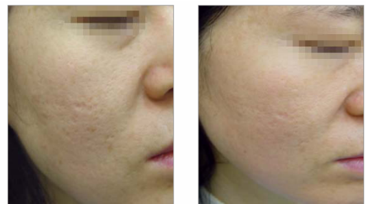
Before and after 1 session.

The answer to all Skin Resurfacing needs