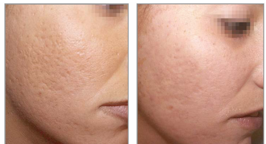
Before and after 1 session.