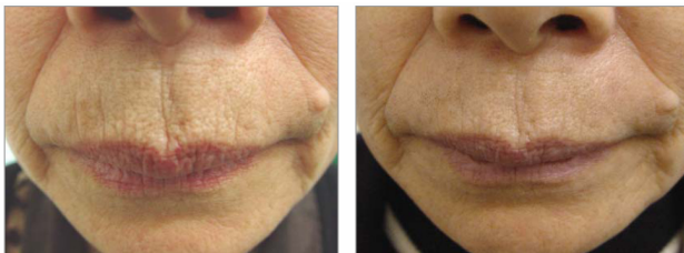
Before and 6 days after 1 session.